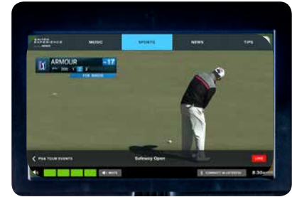
Club Car Connect with Shark Experience