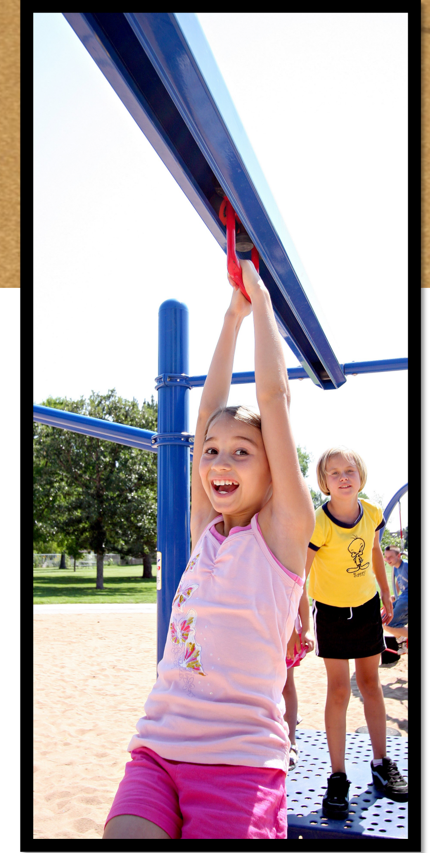
Curved Track Ride