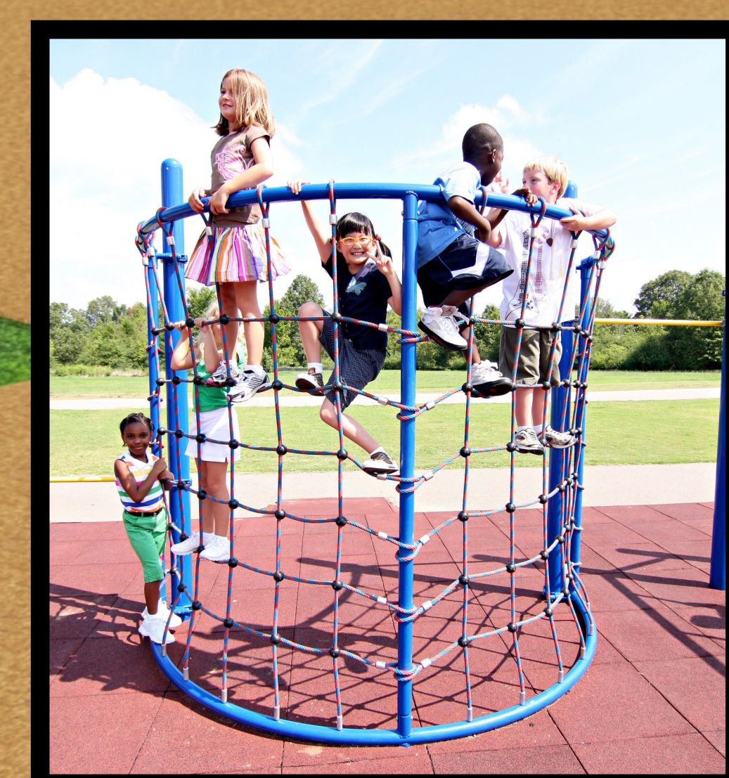
Curved Rope Climbing Wall