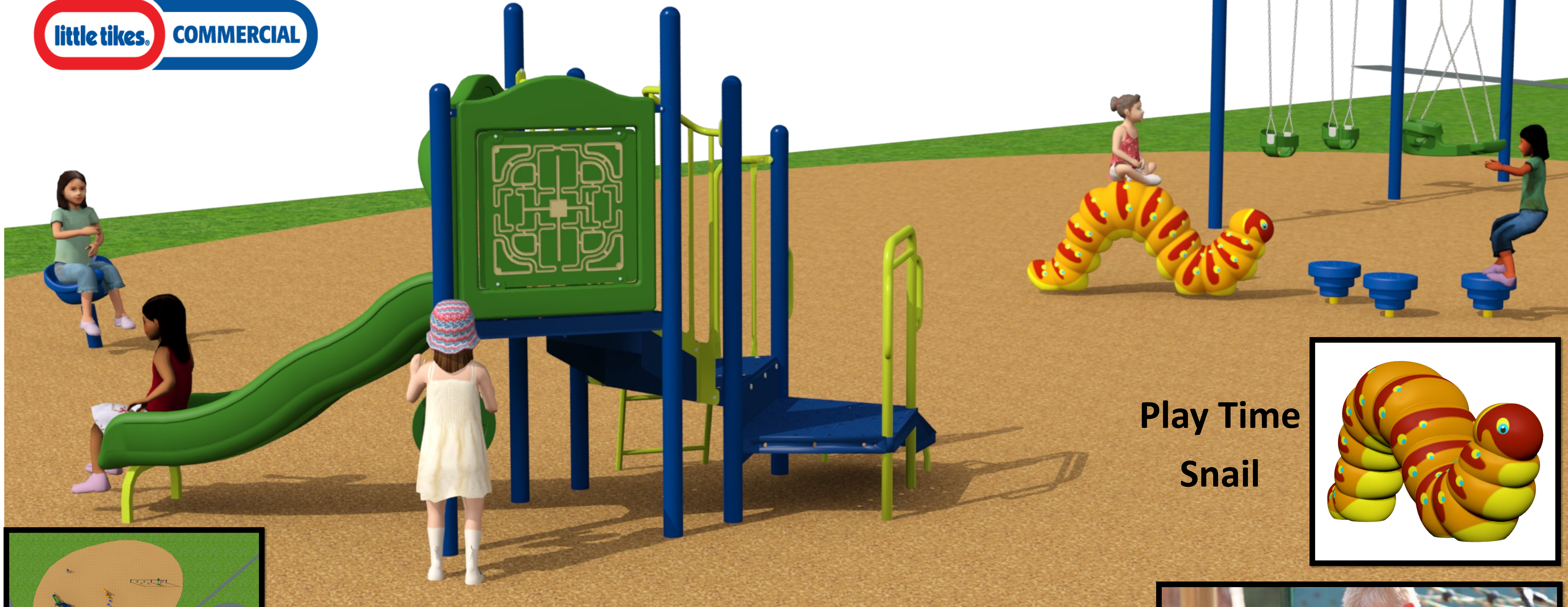
Play Time Snail