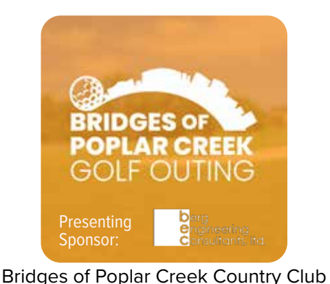
June 25, 2025 Partnering with the Rotary Club of Schaumburg/Hoffman Estates