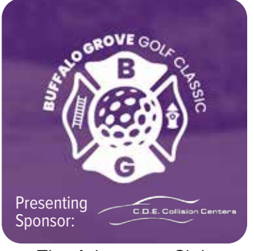
The Arboretum Club August 6, 2025 Partnering with the Rotary Club of Buffalo Grove