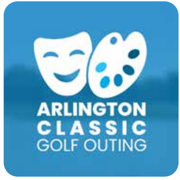
Arlington Lakes Golf Course September 11, 2025 Partnering with the Rotary Club of Arlington Heights