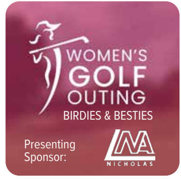
Mt. Prospect Golf Club August 27, 2025